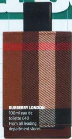
BURBERRY LONDON 100ml eau de toilette £40 From all leading department stores