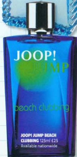
JOOP! JUMP BEACH CLUBBING 125ml £25 Available nationwide