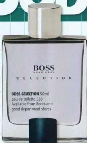
BOSS SELECTION 50ml eau de toilette £33 Available from Boots and good department stores