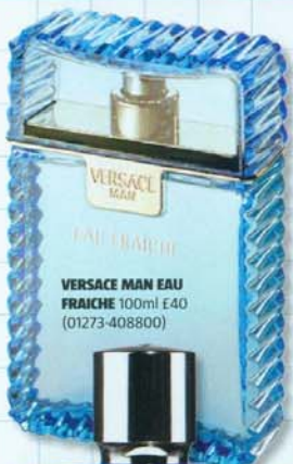
VERSACE MAN EAU FRAICHE 100ml £40 (01273-408800)

You can text your problems to 07914-006910