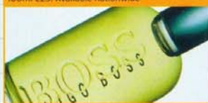
BOSS BY HUGO BOSS 50ml £30. From Boots and department stores