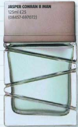
JASPER CONRAN II MAN 125ml £25 (08457-697072)