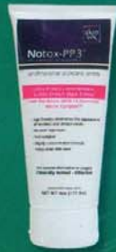
Notox-PP3 A tube costs £99.99 (6oz) exclusively at Farmacia Urban Healing (0870-118123/ www.farmacia123.com )