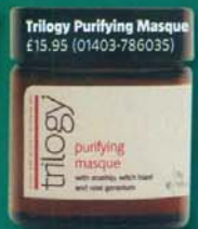
Trilogy Purifying Masque £15.95 (01403-786035)