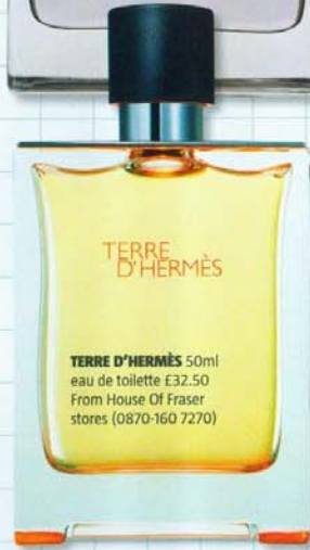
TERRE D'HERMÈS 50ml eau de toilette £32.50 From House Of Fraser stores (0870-160 7270)