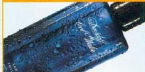
COOL WATER BY DAVIDOFF 100ml £25. Available nationwide

These three are guaranteed to make any lady weep. She may have smelt them before but if you get laid, who cares?