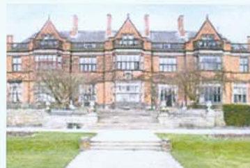
Splendid Hoare Cross Hall in the Midlands.

► GONE are the days when health and beauty spas were places for women, convalescents and somewhat precious men. Now, more and more regular guys are finding there way to spas in pursuit of looking good - accounting for a whacking 300% increase over the past decade, according to recent statistics.